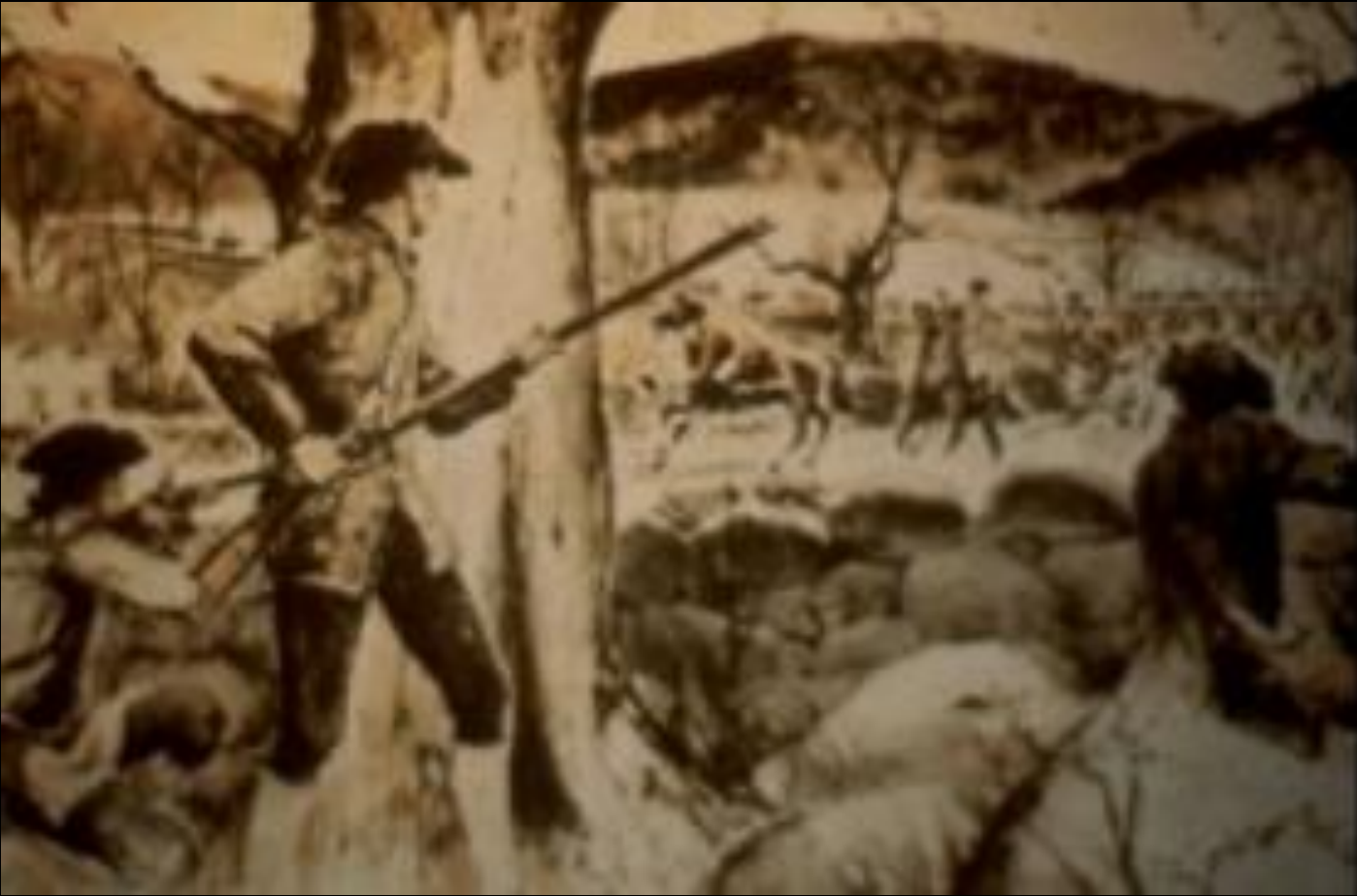
Beginning of the Revolutionary War at Lexington and Concord